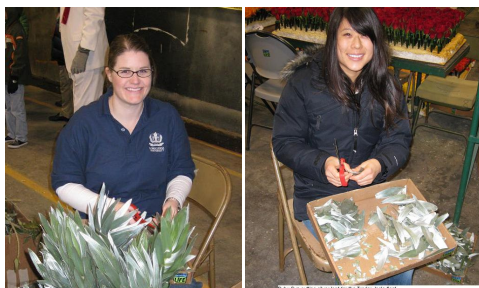
Two women working on the float for the Nurses Week