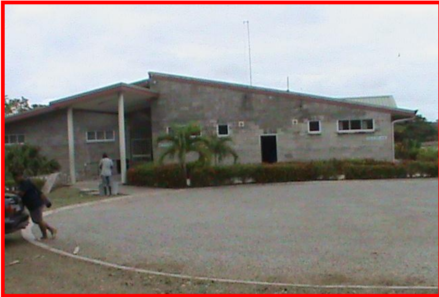
PAU School of Health Science (SOHS)