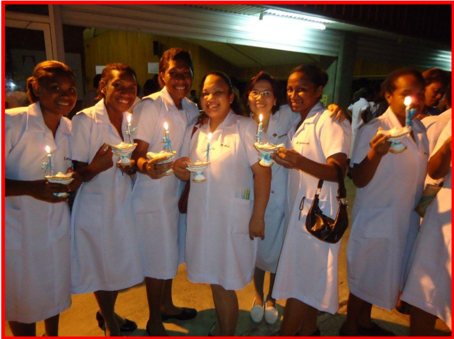
CANDLE LIGHTING CEREMONY 2010