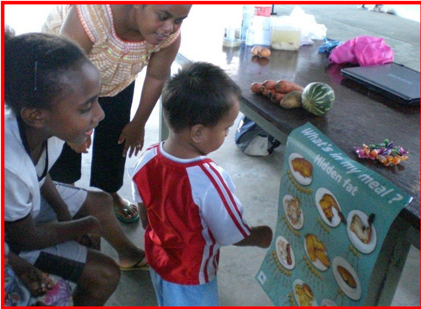
STUDENT DOING HEALTH PROMOTION