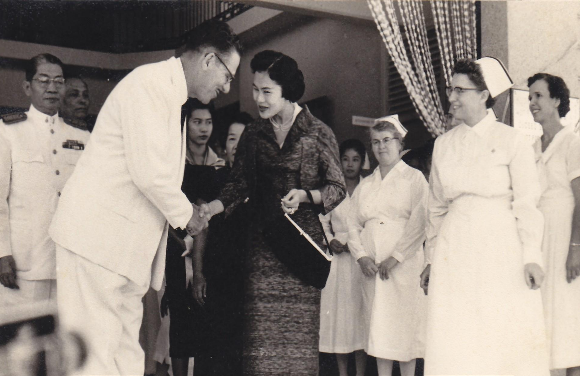
Her Majesty Queen Sirikit came to open the Nursing school building on December 2, 1958.