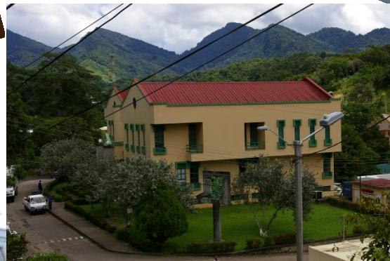
School of Sciences Technology (under which Nursing belongs)