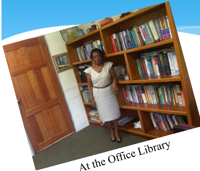
At the Office Library