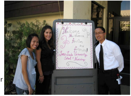
Current Students welcoming new students at the school of nursing orientation September 26, 2010