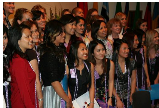
2010 Inductees at the 34th Annual Induction Ceremony June 10, 2010

The 34th Annual Gamma Alpha Induction ceremony held June 10, 2010 ushered in 58 new members. We were privileged to honor 33 undergraduate, 19 graduate, and 6 community nurse leaders for their commitment to nursing excellence, knowledge, service and leadership throughout their careers.