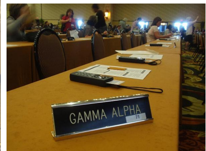
Voting session at Biennium, Gamma Alpha delegates are at the table!