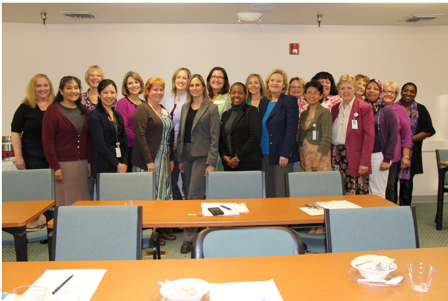
Top: Members in attendance at annual business meeting.