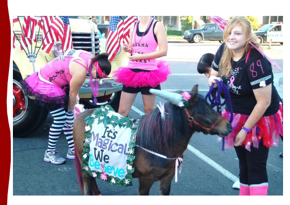
Everybody and their dog was there (horses too)!