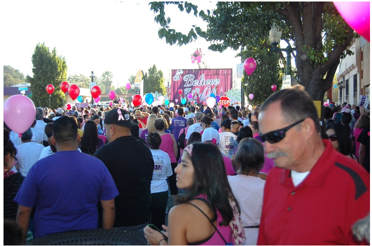
Over 12,000 from the community participated