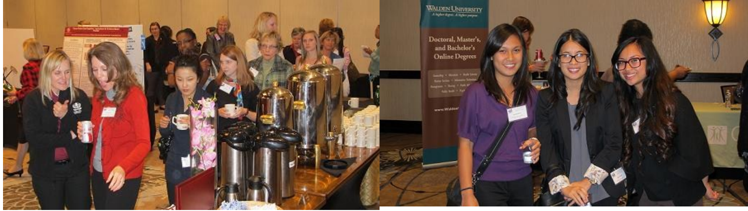
Next year Odyssey will be in San Diego. We want to send students next year. Keeping your dues up-to-date enables us to have the resources to send students to this career enhancing, TOP QUALITY conference. Renew your dues today!