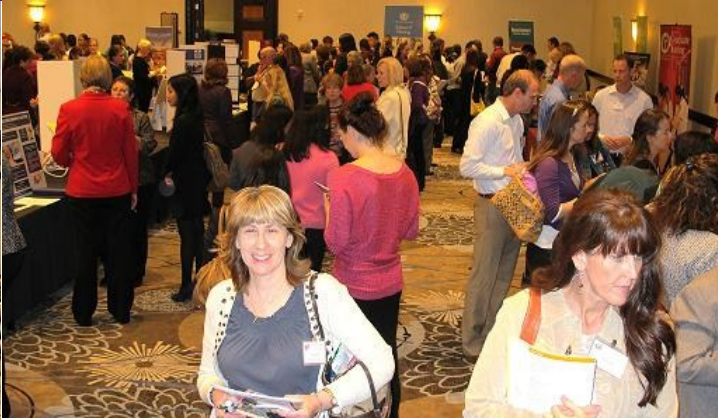
This year's conference was at the Double Tree Hotel in Ontario, CA. There was record attendance—500 registrants over both days of the conference!

November 1 & 2, 2012—Odyssey was an overwhelming success this year. Gamma Alpha was well represented in both attendees, poster presentations and winners! Our chapter sponsored 10 LLU students to attend. There were 47 posters and 15 podium presentations. Keynote speakers were of the highest quality. There was a record number of students participating in the program. It is great to see the researchers and innovators of the future!