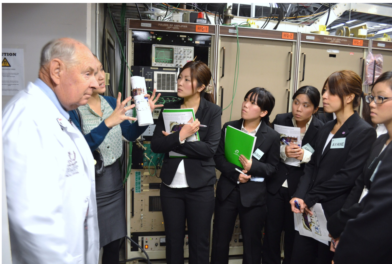
Student enjoyed tours of the Proton treatment center, Heart and Surgical Hospital, the anatomy lab, Zapata Rehabilitation institute, East Campus healing gardens, PossAbilities, Mary's Mercy Center Homeless Shelter, and our Mobile Telemedicine Vehicle.