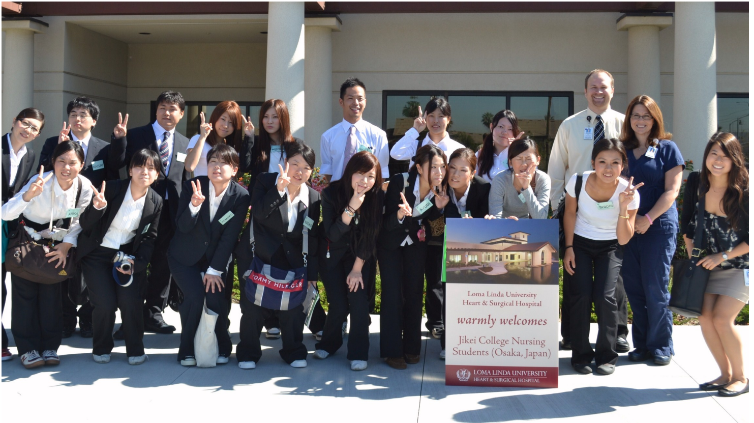
Above: Students are welcomed at the Heart and Surgical Hospital. Below: Zapata Rehabilitation Center